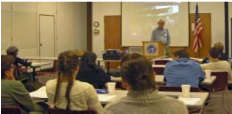
UNA-USA Annual Meeting: "Save Chad/Darfur" at American Red Cross Santa Barbara on February 16th.

On Saturday, February 16 th , UNA-USA Santa Barbara held its annual meeting: "Save Chad/Darfur" at American Red Cross Santa Barbara.