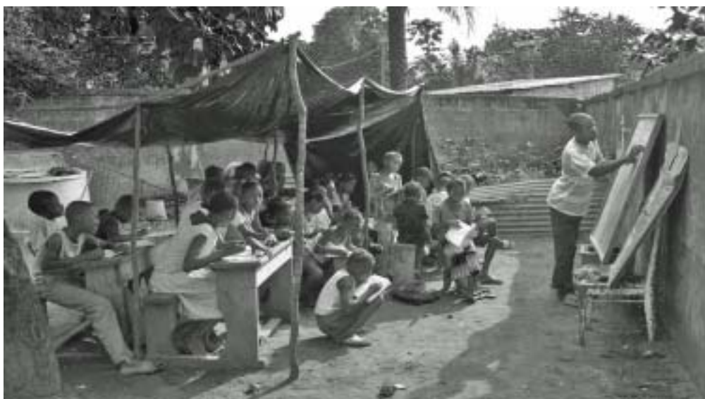
Children of the single mothers and poor families having a free basic education provide by the organization “Urgences d’Afriques” in Brazzaville, Republic of Congo on January 20th, 2008. This free education is held to help the children of single mothers that were raped and abused during and after the civil war.